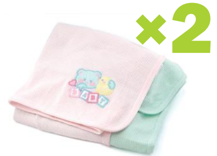
Two receiving blankets, medium- weight cotton or flannel, or crocheted or knitted with lightweight yarn, up to 52" square