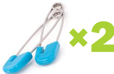
Two diaper pins or large safety pins