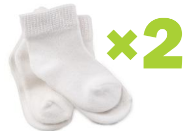
Two pairs of socks