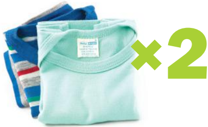
Two lightweight cotton T-shirts (no Onesies®)

Include the following items in each Baby Care Kit: