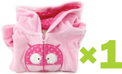
One jacket, sweater or sweatshirt with a hood, or include a baby cap