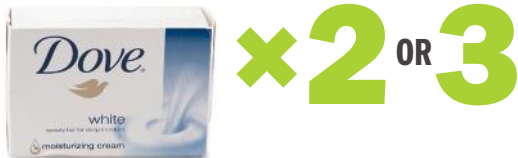
Two or three bath-size bars of gentle soap equaling 8-9 oz., any brand, in original wrapping; no mini or hotel-size bars