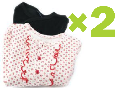
Two long- or short-sleeved gowns or sleepers (without feet)