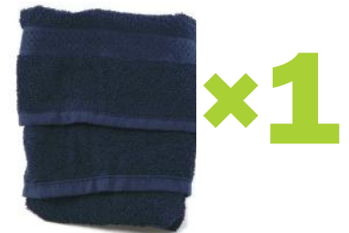
One hand towel, dark color recommended